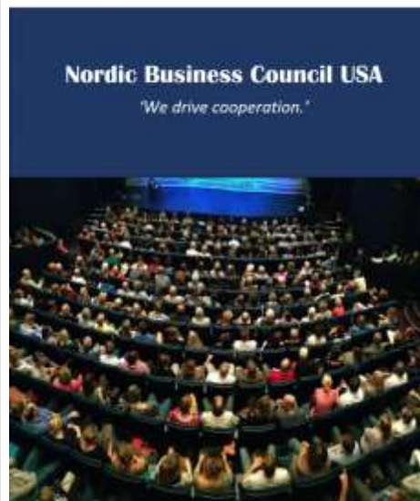
Nordic Business Council USA